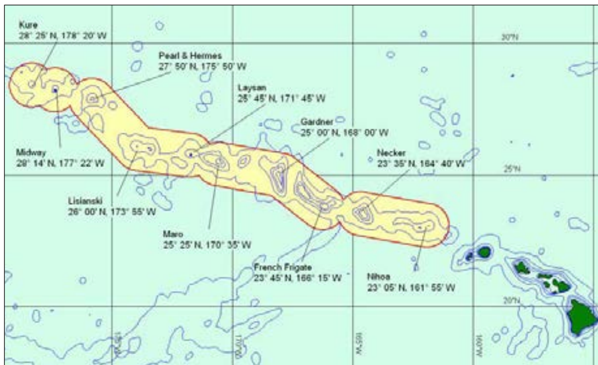
Northwestern Hawaiian Islands Protected Species Zone

Papahānaumokuākea Marine National Monument: Commercial fishing is prohibited in the Monument. The boundary of the Monument is similar to the longline Protected Species Zone, but there are differences. Fishing vessels may transit through the Monument, but entering and leaving the Monument require notifying the Monument office. See 50 CFR Part 404 , for the coordinates and a map of the boundary and other requirements, or contact the Monument office (see Contact Information).